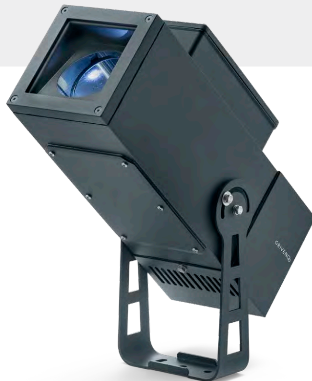
GOBOLED 80 D

Projecting a bright and accurate rendition of graphic designs, logos and patterns in outdoor and indoor locations with the help of a dichroic or metal gobo, the versatile image projector GOBOLED 80 D , fitted with a single powerful LED, provides maximum creativity, dynamism and flexibility for the most demanding design and application requirements.